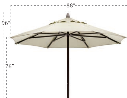
670 7 1/2' Commercial Market Umbrella Weight: 13 lbs 3/3

Note: CG1 is available through our Sunbrella Stock Book Program