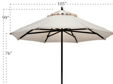
600 9' Commercial Market Umbrella Weight: 14 lbs 3/3