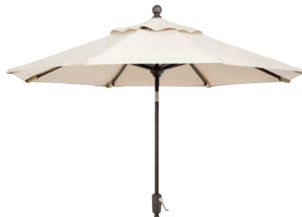
190 9' Value Autotilt Market Umbrella Weight: 16 lbs 1/1