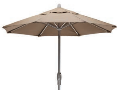
100 7 1/2' Value Push Button Tilt Market Umbrella Weight: 14 lbs 1/1

Important: All umbrellas must be securely fastened to an appropriate base and closed and tied securely during heavy winds.